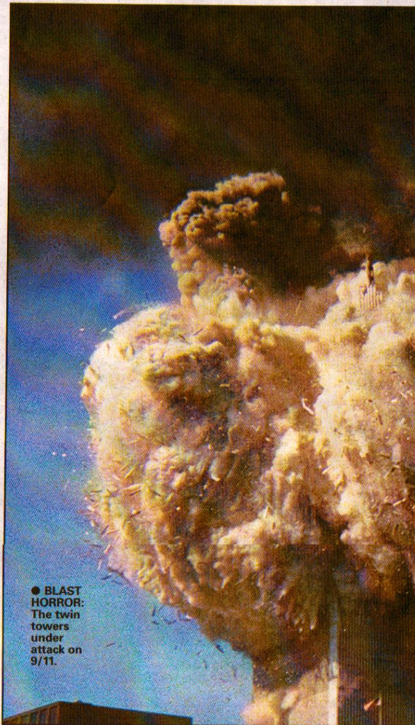
● BLAST HORROR: The twin towers under attack on 9/11.

"It's all about money. They wanted to gain control of oil in Iraq and gas lines in Afghanistan."